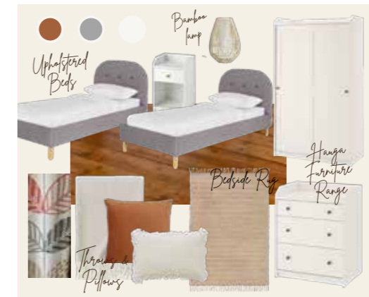
PICTURED Mood board visuals for two bedrooms to help demonstrate to a client how they could style their rental property

Any outlay associated with preparing your rental property should be seen as an investment rather than a cost which is usually paid off quickly by attracting the right guests and tenants.